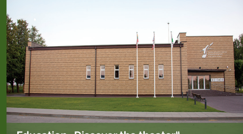
Education „Discover the theater“