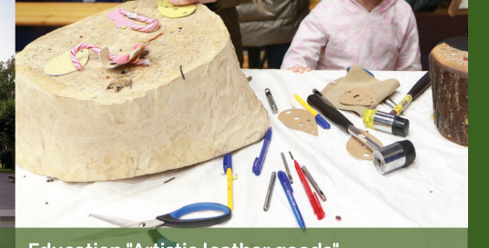
Education "Artistic leather goods"