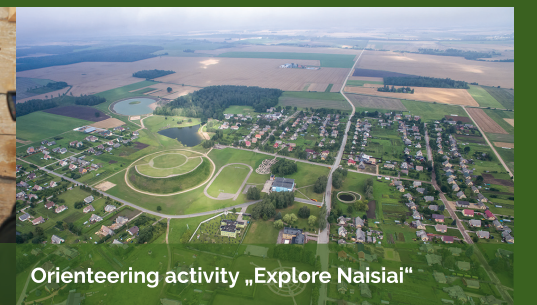
Orienteering activity „Explore Naisiai“