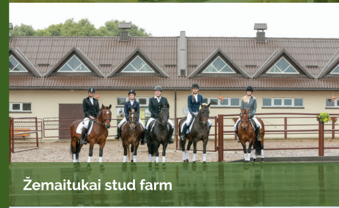
Žemaitukai stud farm